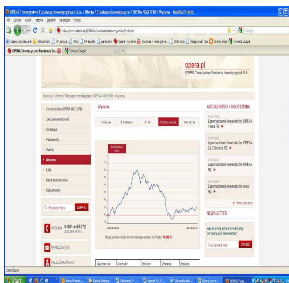
Diagram no 1. Rate of return net since the day of registration OPERA

So far, the Fund had invested resources on bank accounts and on the Technical Investment Fund OPERA NGO SFIO. Purchasing the units of participation is a long term investment. It is assumed that in the further future, the situation on the global markets will get better, the crisis will pass by and the investment will fetch profits. To the date of 31 December 2009, the change of the participation unit got +10,04% since the beginning of the year ( in comparison, at the end of 2008 it was -31,14% ), whereas the valuation loss was 89 710 PLN.